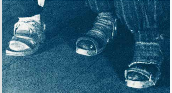
Shoes made from poplar wood and parachute, produced shortly after the War