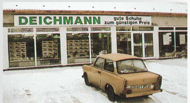
DEICHMANN retail branch in Coswig

The first DEICHMANN retail branch in the new federal states is opened in Coswig near Dresden.