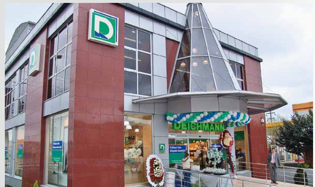
DEICHMANN branch in Turkey

Opening of the first DEICHMANN branches in Turkey and Slovenia.