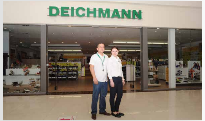
DEICHMANN branch in Russia

In March, the company enters the Russian market. DEICHMANN starts with the new slogan "Because we love shoes." to the spring/summer season.