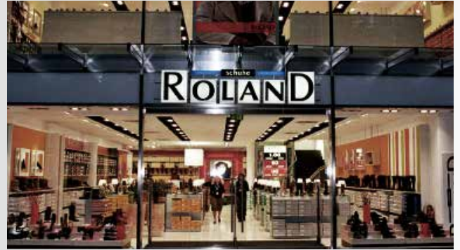
Roland branch in Hamburg

DEICHMANN celebrates its 75 th anniversary and now has 400 branches in Germany. A second distribution centre is opened in Franconian Feuchtwangen. By taking over the until then also owner-managed retail shoe chain ROLAND, the DEICHMANN group is joined by another well-known name. The company, whose original reputation was based on being a provider of men's shoes, is gradually developed into a full-range supplier with modern shops in major German cities.