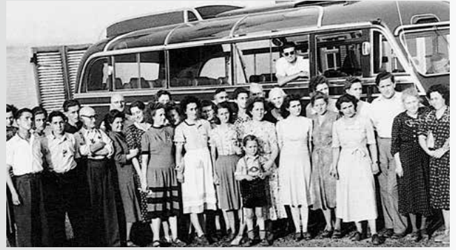
Company outings were part of the corporate culture right from the start.