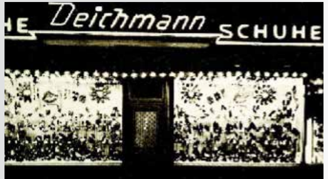
Branch on Ackerstraße in Düsseldorf