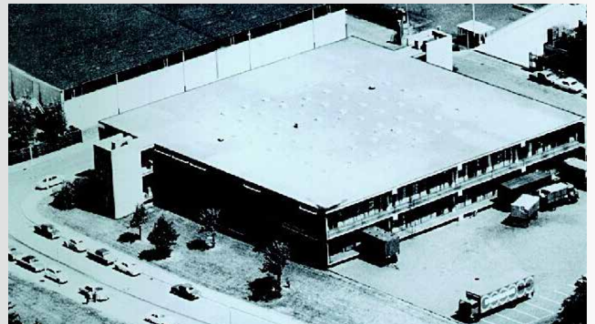
Administration and warehouse building 1968

The company moves into the new administration and warehouse building at Boehnertweg 9 in Essen (today: Deichmannweg). Several extensions and many years later, the company headquarters are still in the same location.