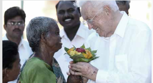
wortundtat has been people in need in India since 1977

During a visit in India, Dr. Heinz-Horst Deichmann is suddenly confronted with hundreds of leprosy sufferers. This encounter affects him to such an extent that he decides to help: soon afterwards he establishes the aid organisation "wortundtat", which provides disadvantaged people with access to medical and social aid and sets up educational and training facilities. Today, in India alone the organisation is helping more than 120,000 people each year.