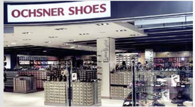
Swiss Ochsner branch

Official opening of the third DEICHMANN distribution centre in Soltau. For the first time, DEICHMANN starts its expansion abroad under its own name - in Austria. In the same year, the company is taking over the Swiss shoe chain OCHSNER.