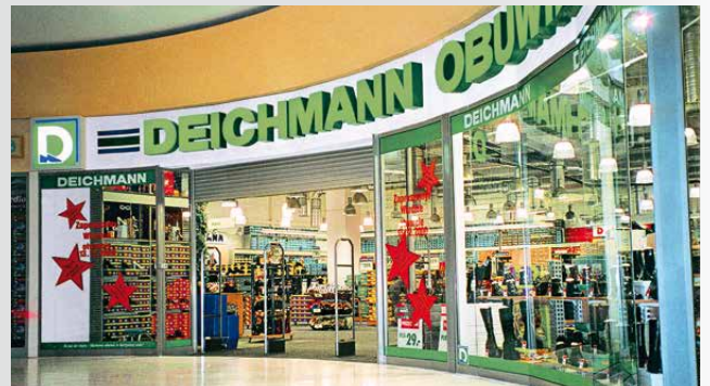
DEICHMANN retail branch in Konin

The first DEICHMANN retail branch in Poland is opened in Konin in May.