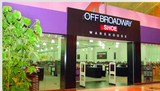
Off Broadway branch in Hazelwood

Takeover of the OFF BROADWAY Group in the USA.