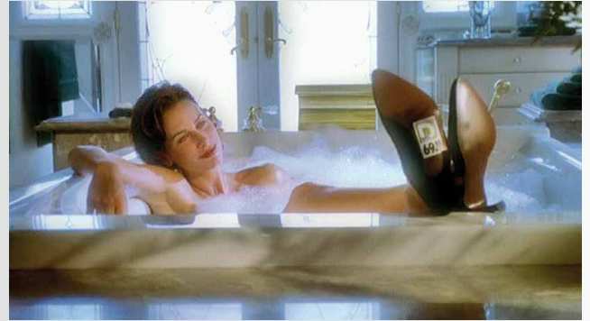
DEICHMANN TV spot

Since German reunification, over 140 DEICHMANN shops have been opened in the new federal states. Start of the first DEICHMANN TV spot, telling the viewer: "Hard to believe - brand-name shoes at such low prices - DEICHMANN."