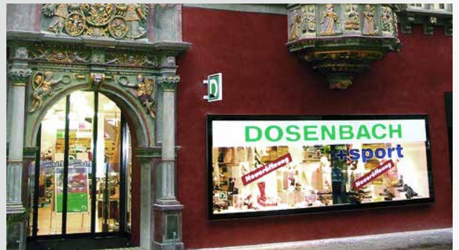
Dosenbach branch in Schaffhausen