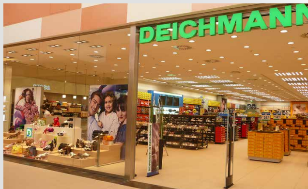
DEICHMANN branch in Italy

DEICHMANN also launches branches Italy and Lithuania.