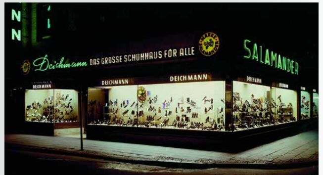
First Branch in Oberhausen