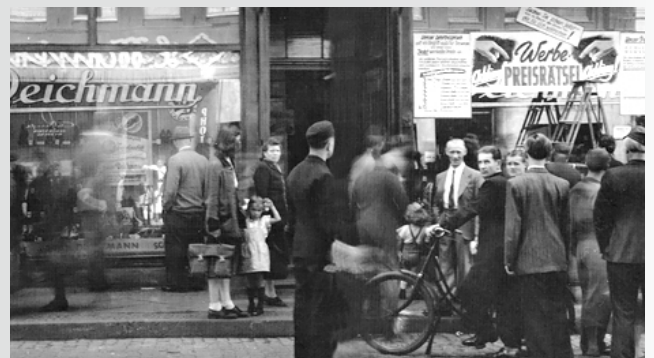
Branch at Borbecker Markt

Opening of the first large shoe shop at Borbecker Markt in Essen.