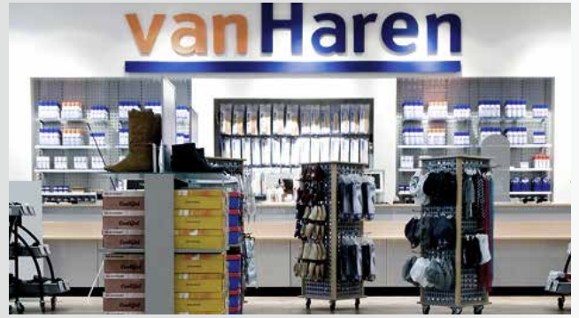
Dutch vanHaren branch