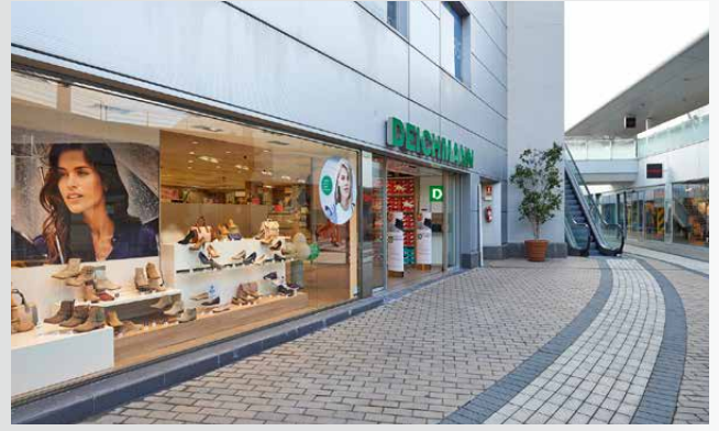
DEICHMANN branch on Majorca

DEICHMANN opens its first branch on Majorca. The Group now operates 25 online shops and is continuing to develop its "omni-channel" strategy – for example, the "ship-to-home" service is now available for the first time.