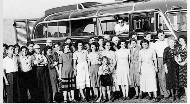
Company outings were part of the corporate culture right from the start.