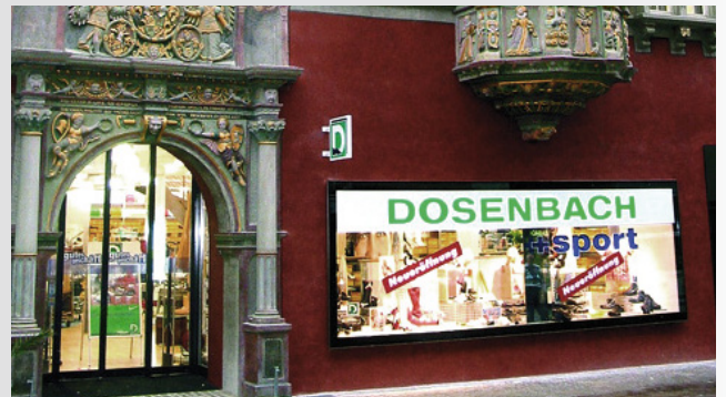
Dosenbach branch in Schaffhausen