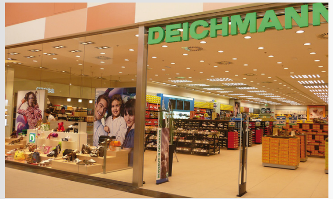
DEICHMANN branch in Italy

DEICHMANN also launches branches Italy and Lithuania.