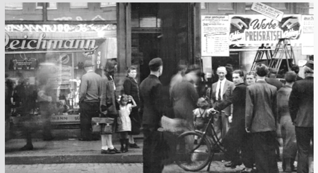
Branch at Borbecker Markt

Opening of the first large shoe shop at Borbecker Markt in Essen.