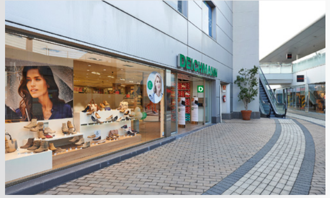
DEICHMANN branch on Majorca

DEICHMANN opens its first branch on Majorca. The Group now operates 25 online shops and is continuing to develop its "omni-channel" strategy – for example, the "ship-to-home" service is now available for the first time.