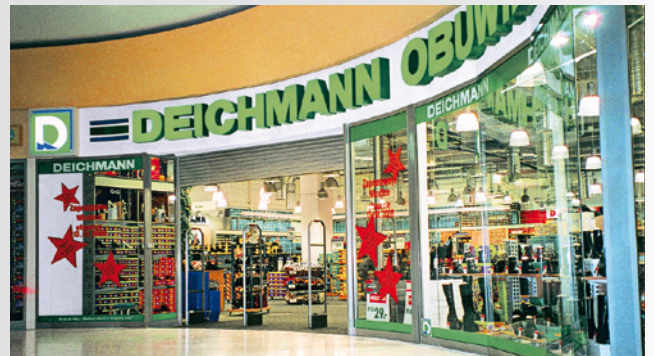
DEICHMANN retail branch in Konin

The first DEICHMANN retail branch in Poland is opened in Konin in May.