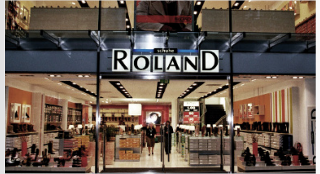
Roland branch in Hamburg

DEICHMANN celebrates its 75 th anniversary and now has 400 branches in Germany. A second distribution centre is opened in Franconian Feuchtwangen. By taking over the until then also owner-managed retail shoe chain ROLAND, the DEICHMANN group is joined by another well-known name. The company, whose original reputation was based on being a provider of men's shoes, is gradually developed into a full-range supplier with modern shops in major German cities.