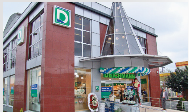
DEICHMANN branch in Turkey

Opening of the first DEICHMANN branches in Turkey and Slovenia.