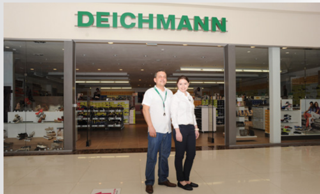
DEICHMANN branch in Russia

In March, the company enters the Russian market. DEICHMANN starts with the new slogan "Because we love shoes." to the spring/summer season.