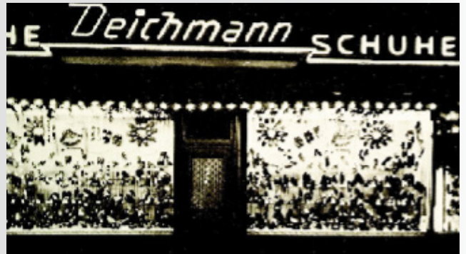
Branch on Ackerstraße in Düsseldorf