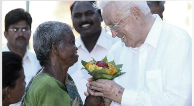
wortundtat has been people in need in India since 1977