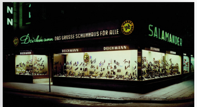
First Branch in Oberhausen