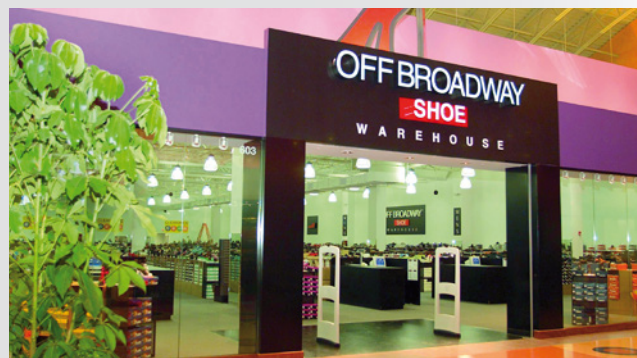
Off Broadway branch in Hazelwood

Takeover of the OFF BROADWAY Group in the USA.