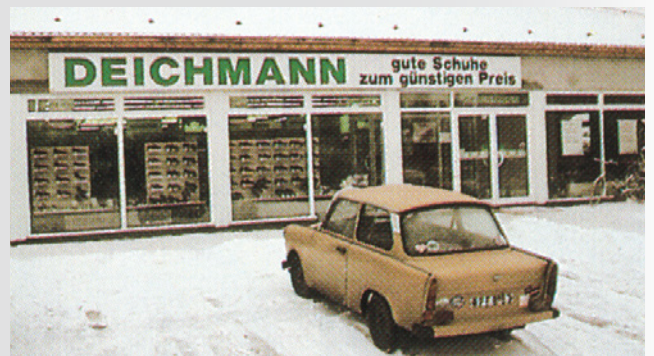
DEICHMANN retail branch in Coswig

The first DEICHMANN retail branch in the new federal states is opened in Coswig near Dresden.