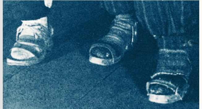
Shoes made from poplar wood and parachute, produced shortly after the War