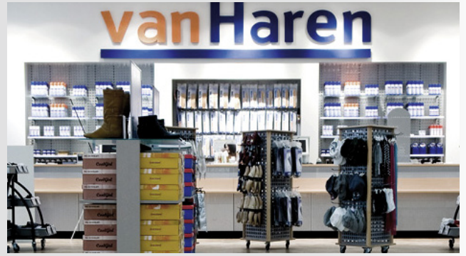
Dutch vanHaren branch