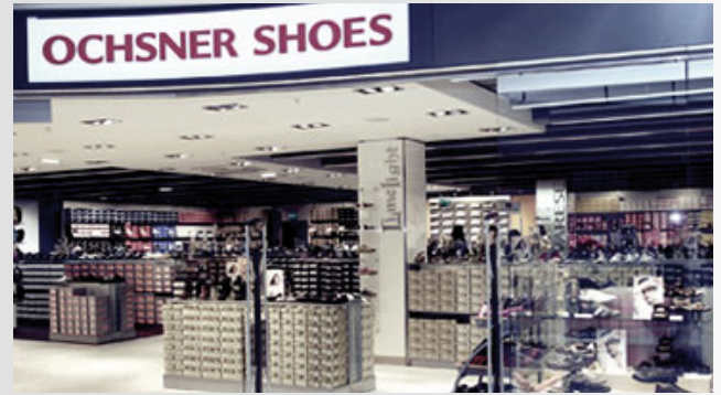
Swiss Ochsner branch

Official opening of the third DEICHMANN distribution centre in Soltau. For the first time, DEICHMANN starts its expansion abroad under its own name - in Austria. In the same year, the company is taking over the Swiss shoe chain OCHSNER.