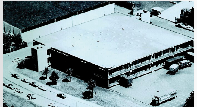
Administration and warehouse building 1968

The company moves into the new administration and warehouse building at Boehnertweg 9 in Essen (today: Deichmannweg). Several extensions and many years later, the company headquarters are still in the same location.