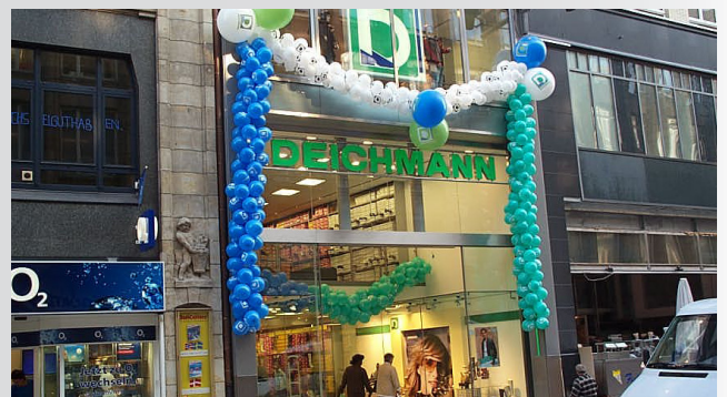
Deichmann branch in Hamburg

The sales branch with the consecutive number 700 opens in Hamburg.