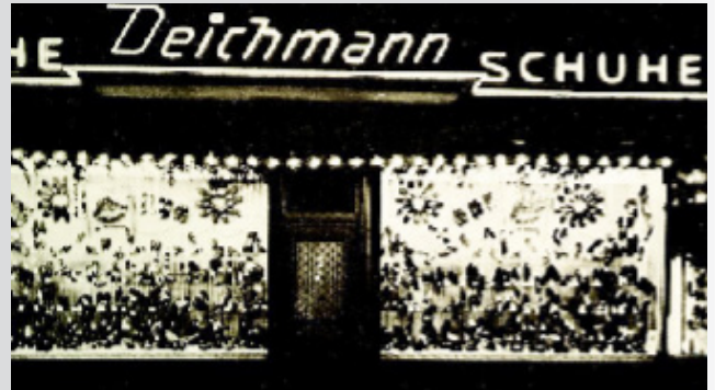
Former Deichmann branch on Ackerstraße in Düsseldorf