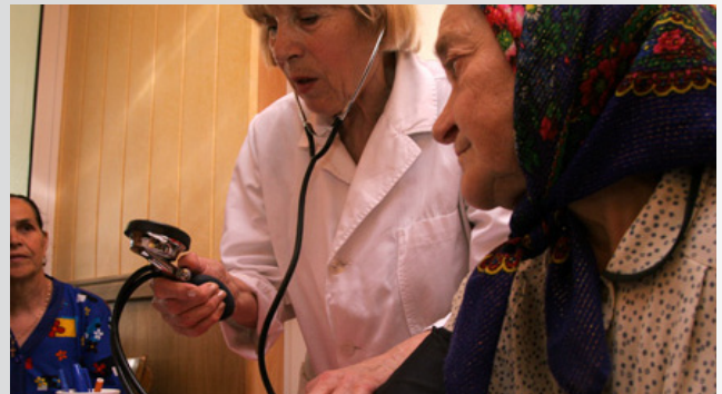
In 2006, wortundtat launches its aid projects in the Republic of Moldova

Here, support is given to the diaconal centre Gloria in Ceadir Lunga, a town with a population of 20,000.