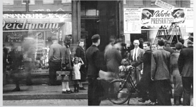
Former branch at Borbeck Market

Shoemaker's workshop and branch move to Borbeck Market, to Borbecker Straße 129.