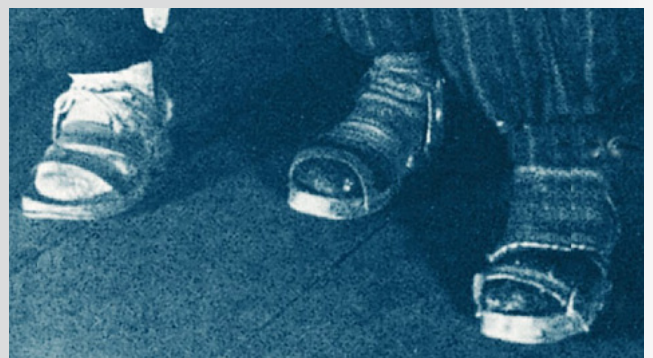
Shoes produced shortly after the war made from poplar wood and parachute harnesses.