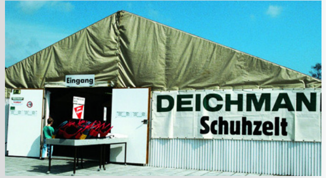
Deichmann sales tent in Schleusingen during the Wende