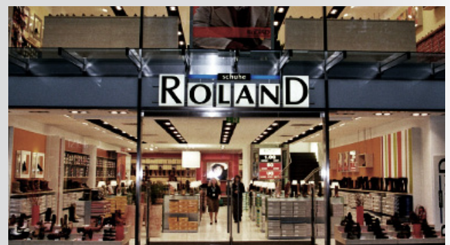
Roland branch in Hamburg

DEICHMANN celebrates its 75th anniversary and has now 400 branches across Germany. A second distribution centre is opened in Franconian Feuchtwangen. By taking over the also owner managed shoe retail chain ROLAND, the DEICHMANN group adds a new name to its portfolio. The enterprise, which had originally made a name for itself as a supplier of men's shoes, is gradually developed into a company providing the full range of products, located in modern premises in major German cities.