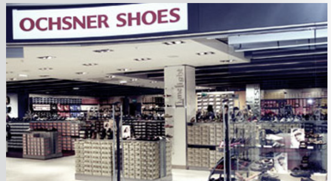
Swiss Ochsner branch

In Austria too, citizens are now able to buy their shoes from DEICHMANN. At the same time, the company is taking over the shoe chain OCHSNER in Switzerland.