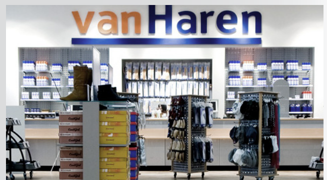
Dutch vanHaren branch