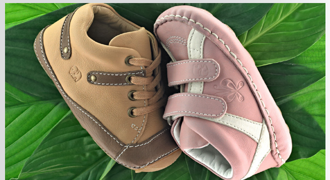
Green models of the Elefanten range

For the first time, DEICHMANN brings shoes for the brands Elefanten, Gallus and Medicus to the market, which have been produced in accordance with special Eco Standards.