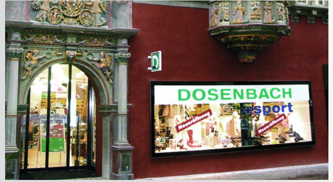
Dosenbach branch in Schaffhausen