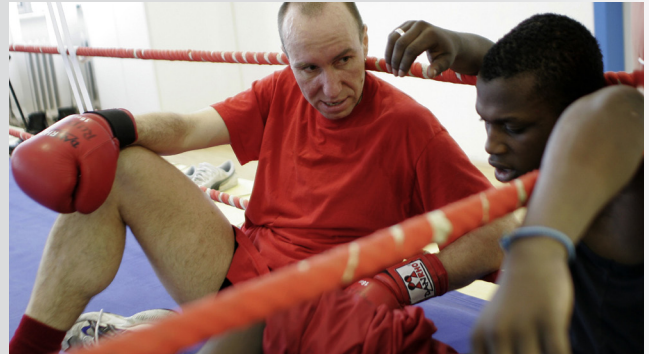
The Deichmann Award is launched in 2005

To give young people the opportunity of getting a sound vocational education after leaving school, DEICHMANN has for many years been provided far more apprenticeships than were actually required. In order to draw attention to less well educated young people or those from poorer backgrounds and to motivate employers to give them a chance, the company launches the DEICHMANN Award with a total value of 100,000 Euro. Since then, it has been awarded annually.