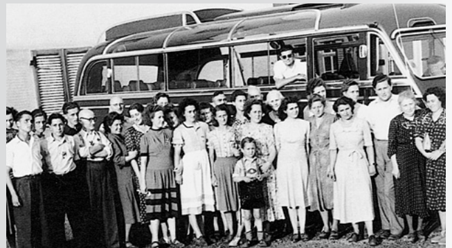
Company outings have been part of DEICHMANN's business culture right from the beginning.