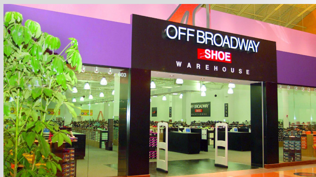
Off Broadway branch in Hazelwood

The company also takes over the American shoe chain OFF BROADWAY, which operates large shoe stores in the USA.