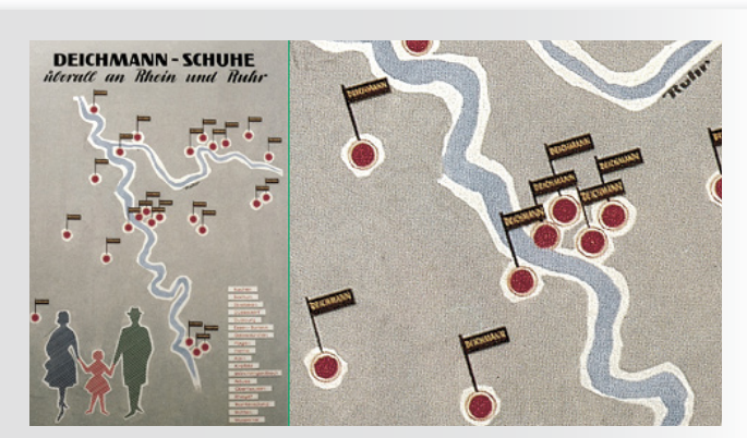
Growing store network.

The company celebrates its 50<sup>th</sup> anniversary. Customers can now shop in 16 specialised DEICHMANN retail branches between Rhine and Ruhr.