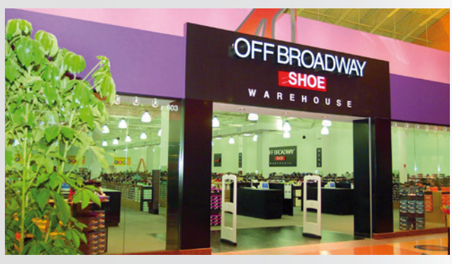
Takeover of the OFF BROADWAY Group in the USA.