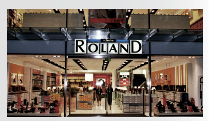
Roland branch in Hamburg

DEICHMANN celebrates its 75<sup>th</sup> anniversary and now has 400 branches in Germany. A second distribution centre is opened in Franconian Feuchtwangen. By taking over the until then also owner-managed retail shoe chain ROLAND, the DEICHMANN group is joined by another well-known name. The company, whose original reputation was based on being a provider of men's shoes, is gradually developed into a full-range supplier with modern shops in major German cities.