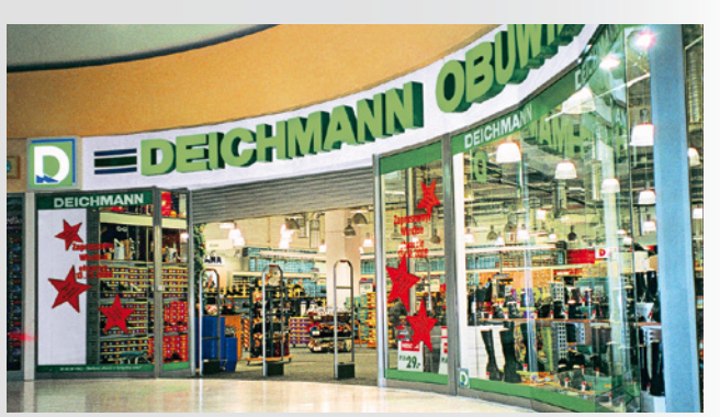
DEICHMANN retail branch in Konin

The first DEICHMANN retail branch in Poland is opened in Konin in May.