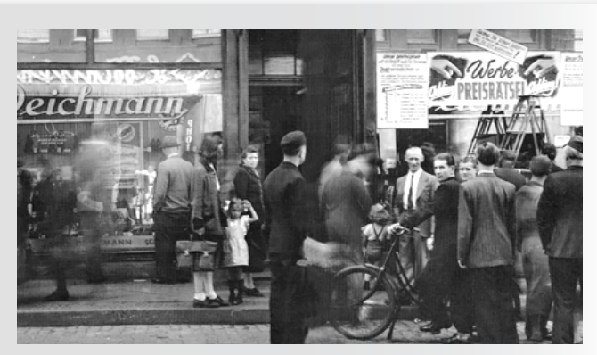
Branch at Borbecker Markt

Opening of the first large shoe shop at Borbecker Markt in Essen.