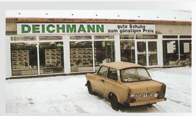
DEICHMANN retail branch in Coswig

The first DEICHMANN retail branch in the new federal states is opened in Coswig near Dresden.