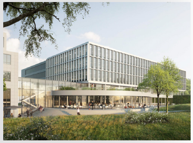
Illustration: bloomimages; gmp Architekten

DEICHMANN looks to the future and makes a lasting commitment to its Essen site: We announce our intention to expand our Central Administration on Aktienstrasse in Essen-Schönebeck and completely update our existing building. Initial work starts at the beginning of 2022. The heart of the project is a five-storey atrium building. The prestigious new building with underground parking becomes the entrance to the campus and is surrounded by landscaped green areas. The campus upgrade aims to create contemporary working worlds with a high quality of occupancy, following an integrated ecological concept that takes account of the latest developments in energy supply and management.