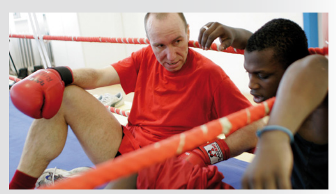
The Deichmann Award is launched in 2005.

The "DEICHMANN Award", which supports initiatives against youth unemployment, is launched. The prize honours schools, companies or initiatives, whose aim it is to help disadvantaged young people to enter the labour and training market. Since then, it has been awarded annually.