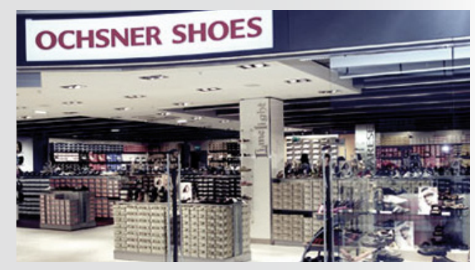
Swiss Ochsner branch

Official opening of the third DEICHMANN distribution centre in Soltau. For the first time, DEICHMANN starts its expansion abroad under its own name - in Austria. In the same year, the company is taking over the Swiss shoe chain OCHSNER.