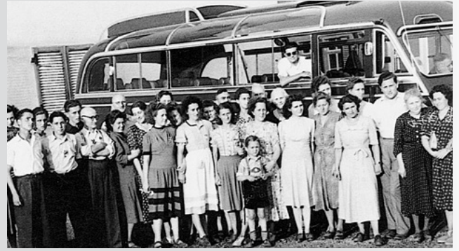
Company outings were part of the corporate culture right from the start.