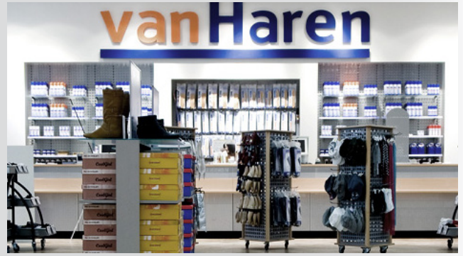
Dutch vanHaren branch