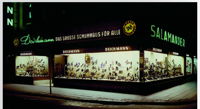
First Branch in Oberhausen