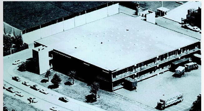
Administration and warehouse building 1968

The company moves into the new administration and warehouse building at Boehnertweg 9 in Essen (today: Deichmannweg). Several extensions and many years later, the company headquarters are still in the same location.