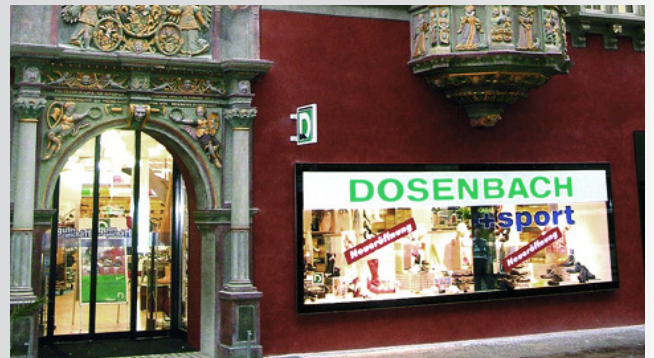
Dosenbach branch in Schaffhausen