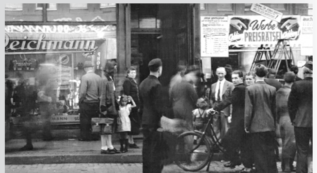
Branch at Borbecker Markt

Opening of the first large shoe shop at Borbecker Markt in Essen.