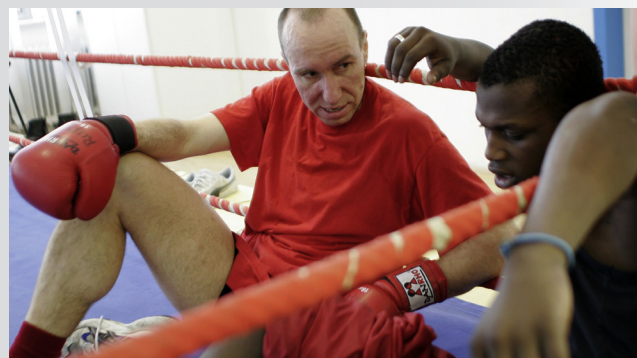
The Deichmann Award is launched in 2005

The "DEICHMANN Award", which supports initiatives against youth unemployment, is launched. The prize honours schools, companies or initiatives, whose aim it is to help disadvantaged young people to enter the labour and training market. Since then, it has been awarded annually.