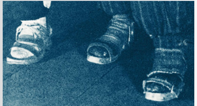
Shoes made from poplar wood and parachute, produced shortly after the War