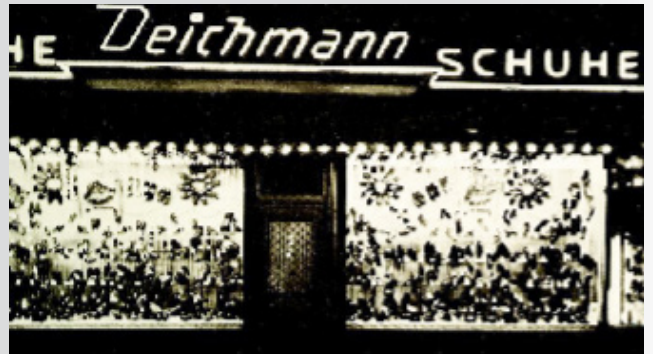
Branch on Ackerstraße in Düsseldorf