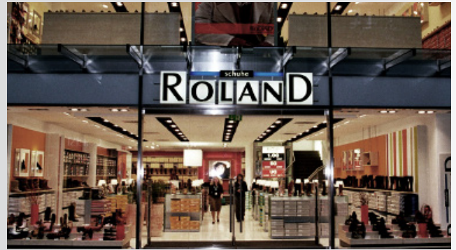
Roland branch in Hamburg

DEICHMANN celebrates its 75 th anniversary and now has 400 branches in Germany. A second distribution centre is opened in Franconian Feuchtwangen. By taking over the until then also owner-managed retail shoe chain ROLAND, the DEICHMANN group is joined by another well-known name. The company, whose original reputation was based on being a provider of men's shoes, is gradually developed into a full-range supplier with modern shops in major German cities.