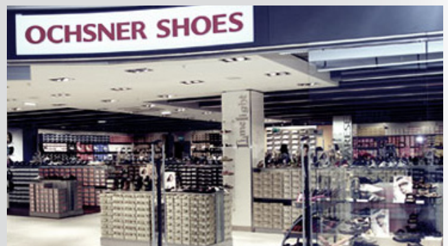
Swiss Ochsner branch

Official opening of the third DEICHMANN distribution centre in Soltau. For the first time, DEICHMANN starts its expansion abroad under its own name - in Austria. In the same year, the company is taking over the Swiss shoe chain OCHSNER.